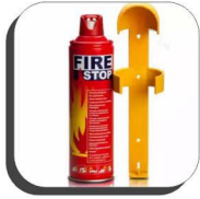
Fire Stop Bottle