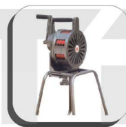
Manual Fire Alarm