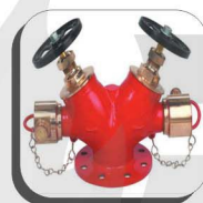
Fire Hydrant Valve