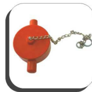
Hydrant Cap with Chain