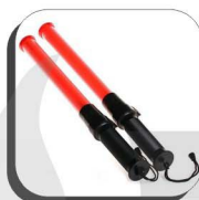
Traffic Button Light