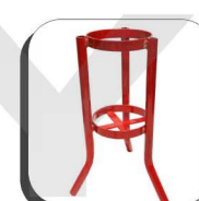
Fire Extinguisher Stand