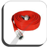
Rubber Fire Hose