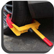
Car Wheel Lock