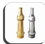
Short Branch Pipe