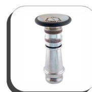
Triple Purpose Branch