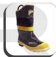
Fire Fighter Shoes