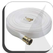
Canvas Fire Hose