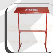
Fire Bucket with Stand