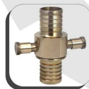
Male Female Coupling