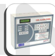
Fire Alarm Panel