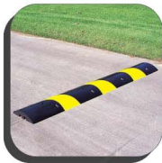
Rubber Speed Bump